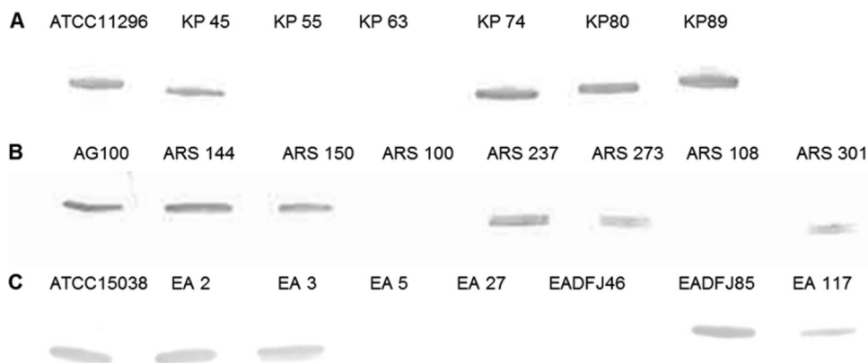
FIG 1 Immunodetection by Western blotting of porins in various bacterial strains grown in MHII broth. Detection was carried out with a mix of anti-OmpF antiserum and anti-OmpC antiserum. (A) K. pneumoniae strains; (B) E. coli strains; (C) E. aerogenes strains. Only the relevant part of the gel is shown.